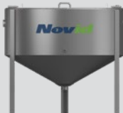
MT120 120 US GAL