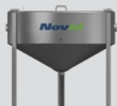
MT60 60 US GAL

Rinse ring with 3/4" hose connect comes standard on all mix tanks.