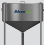
MT80 80 US GAL