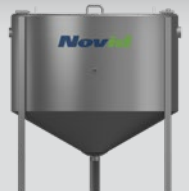
MT250 250 US GAL