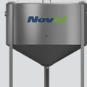
MT150 150 US GAL